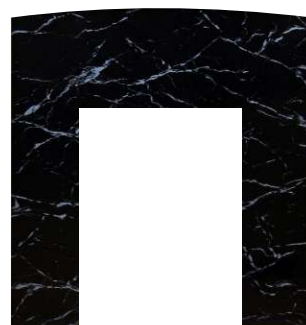
Includes black / white reversible marble effect laminate panel